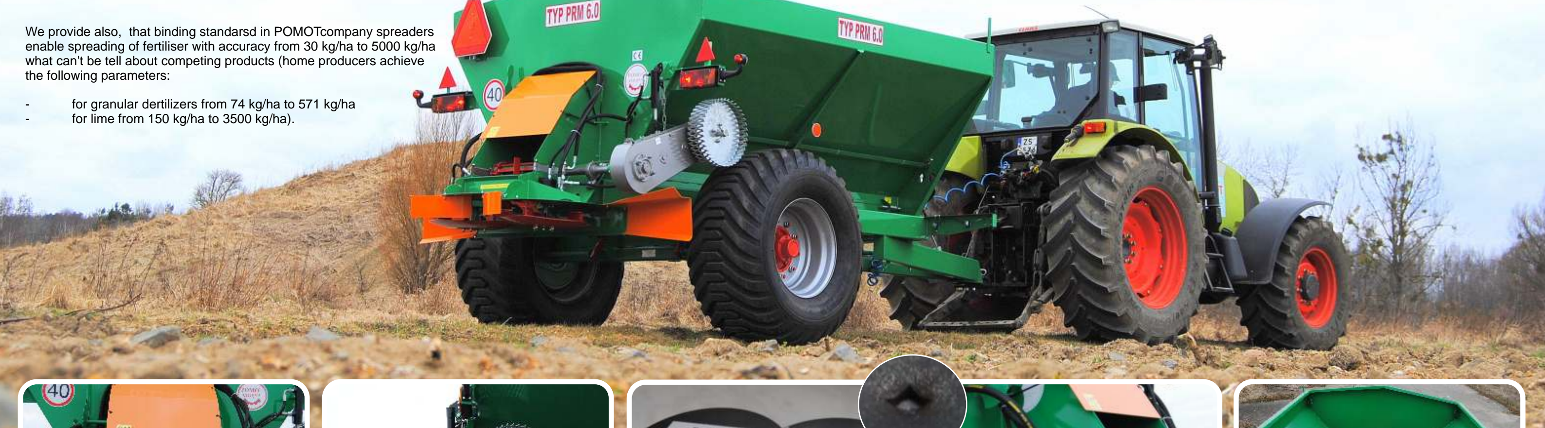
Niezniszczalne ograniczniki rozsiewu